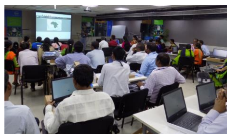
CEO, Sikshana Foundation briefing Teachers about Sikshanapedia Software