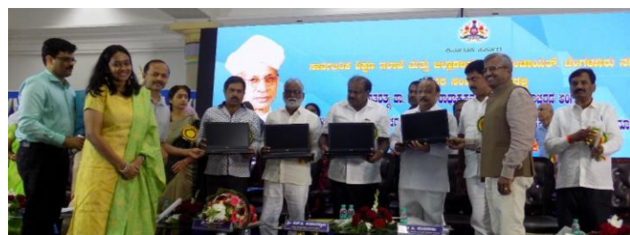
Launch of STEP program in 57 KPS on 5 th Sep 2018, as part of Teachers Day, at Vidhana Soudha