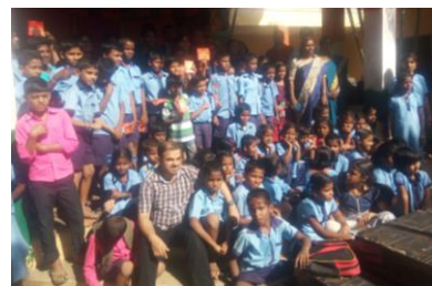
Group Pic with Students

Volunteers engaged 75 students in various activities such as drawing/painting, arts & crafts, pick & speak, essay writing etc. Games such as sticking stickers, Blow the ball, Save the Balloon, pick & drop thermocol balls for grades 1 st to 3 rd . Volunteers interacted with students of grades 4 th to 7 th about Protection of our Environment, its pros & cons. The programme was well received by the teachers who felt that such activities played a significant role in honing various talents in students.