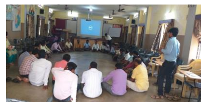
Group Discussion on Data Analysis

e-Edu Management Programme is a Two-Day Residential Training designed